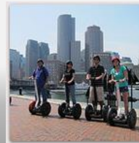
1 Hour Segway Tour of the Boston Harbor Walk.