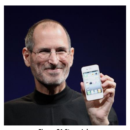
Figure 21 Steve Jobs Photo by Mat Yohe https://commons.wikimedia.org/wiki/File:Ste ve Jobs Headshot 2010-CROP.jpg

The late Steve Jobs is one of the best-known entrepreneurs for his founding of Apple with Steve "Woz" Wozniak in 1976 to sell the Apple I and then II computers. They were hugely successful and were followed up by the Macintosh.