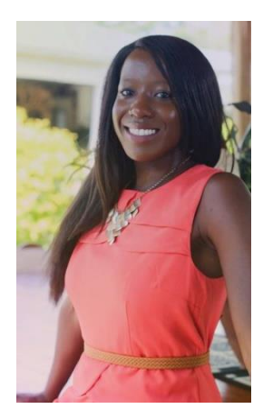
Figure 15

She launched EcoSchool Academy<sup>14</sup> to serve 9 million subscribers with an interactive mobile learning environment which provides 50 short courses covering a range of topics. 15