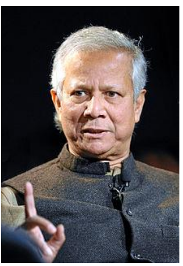
Figure 18 Muhammad Yunus

He is credited with creating the system of microcredit and microfinance and was awarded the Nobel Peace Prize for that work. He founded Grameen Bank to make these programs viable, sustainable, and scalable. In the late 1980s, Grameen started to diversify by attending to underutilized fishing ponds and irrigation pumps like deep tube wells. As these project grew and diversified, the fisheries project became Grameen Motsho ("Grameen Fisheries Foundation") and the irrigation project became Grameen Krishi ("Grameen Agriculture Foundation"). In time, the Grameen initiative grew into a multifaceted group of profitable and non-profit ventures, including