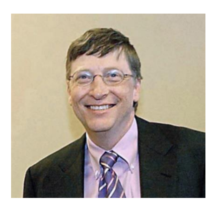
Figure 4 Bill Gates

When IBM decided to get into the personal computer business, they designed the first IBM PC hardware, but needed an operating system for the PC. An operating system already existed; it was called CPM. Writers argue about whether it was because IBM was too cheap to license CPM or simply because negotiations broke down for other reasons, but the result was that IBM looked around to find someone to write clone of CPM. They contracted with Gates and his fledgling company, Microsoft. To develop that operating system they built on an existing operating system