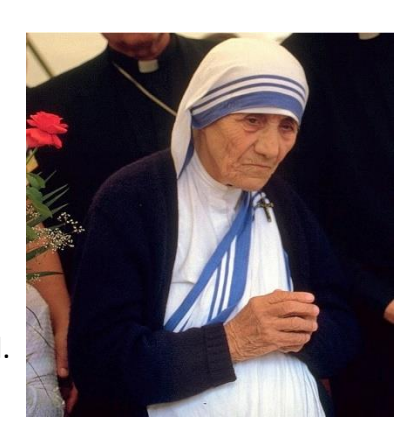
Figure 5 Mother Teresa