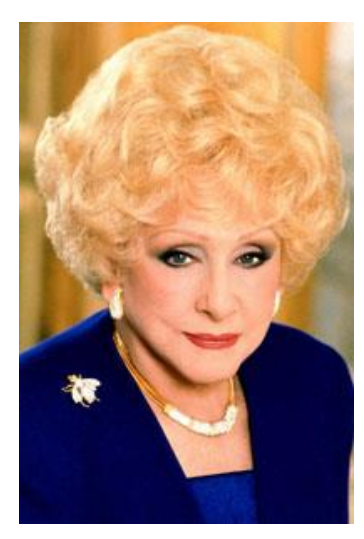
Figure 20 Mary Kay Ash

What motivated Mary Kay from the beginning was that she