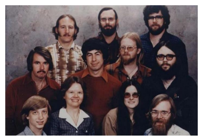
Figure 2 Microsoft Founders

By taking a brief look at a few entrepreneurs, perhaps we can glean some insight into who they are, what motivates them, and how they operate. We will want to build on this insight throughout the text by looking at the research that defines entrepreneurial characteristics, but having some concrete stories will illuminate the dry statistics.