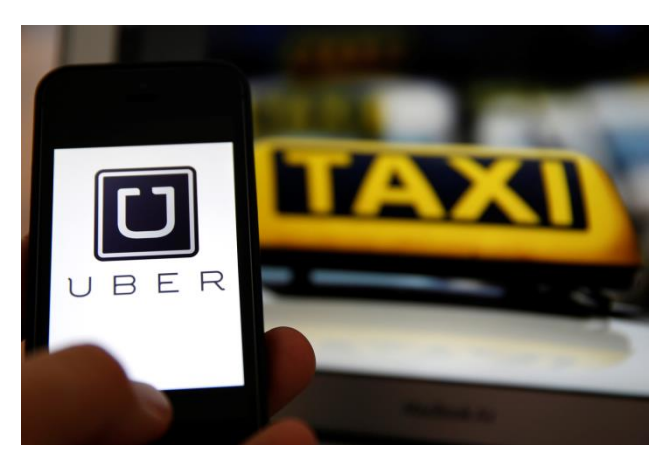
Figure 1 Uber

Uber was founded in 2009 by Garrett Camp and Travis Kalanick as "UberCab." They met at LeWeb in Paris, France in 2008. Camp was annoyed by, wanted to solve, the Taxi problem in San Francisco. They came up with a plan to recruit drivers with private cars and then pair them up with people who needed a ride. The original pitch split the cost of a driver, a Mercedes S Class car, and a parking spot and organized this with an iPhone app.