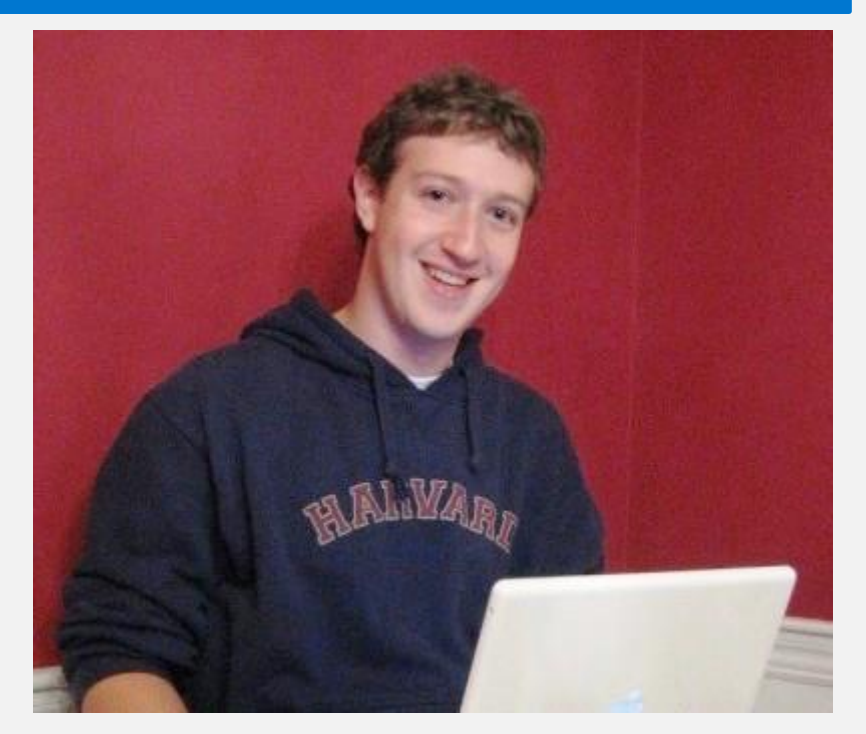
Flickr: This file is licensed under the Creative Commons Attribution 2.0 Generic license.

He also signed the Giving Pledge and has already given $100 million to Newark Schools