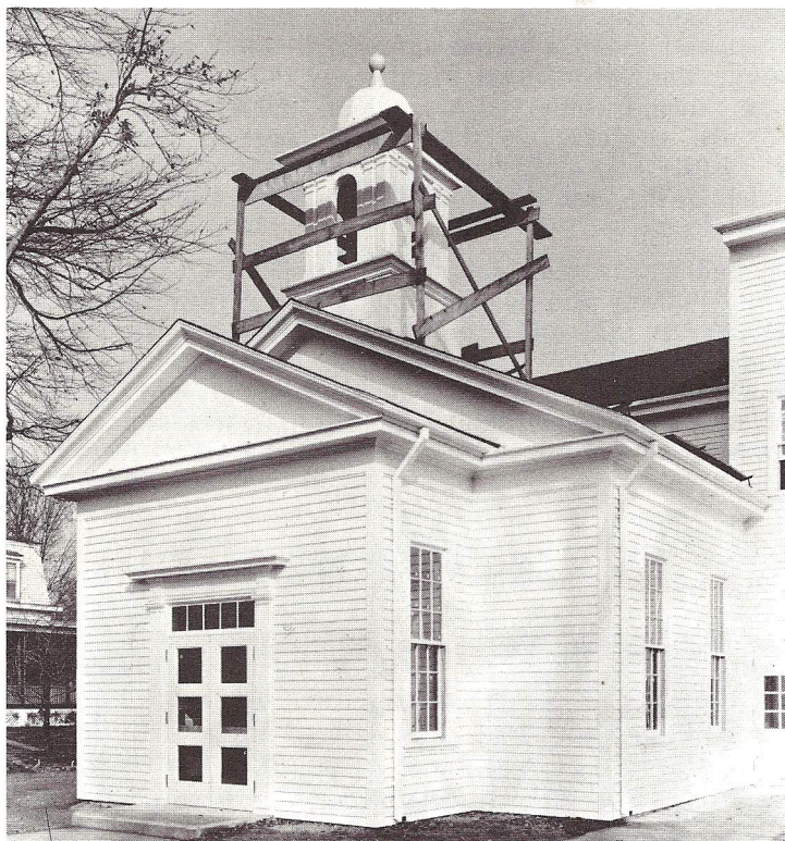
THE PARKMAN CHAPEL